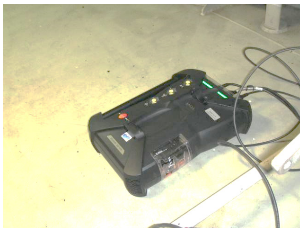
Figure 2. Analyzer box

the measurement of exhaust gas emissions 8) . The gas analyzer has a certificate according to MARPOL Annex VI and NOx Technical Code 2008. It consists of a control unit, analyzer box, and gas sampling probe with probe pre-filter as visible on Figures 2 – 3. It can be used for monitoring emissions on board or performing tests if engines have had some modifications. Technical information of the instrument is given in Table 1 8) .