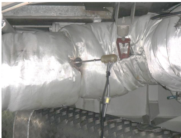
Figure 6. Exhaust gas sampling point