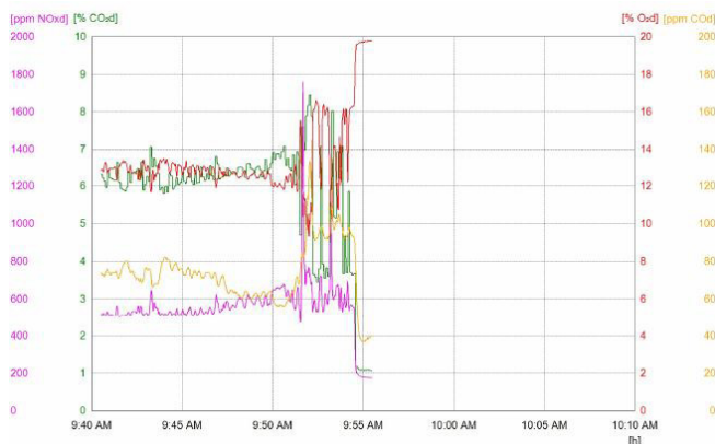
Figure 9. Arrival in Supetar port

The attached diagrams show an increase in exhaust emissions at the very beginning of the maneuvering phase during the departure from the port of Split. After switching to the “at sea” navigation phase, exhaust emissions have stabilized and are declining. Switching from the “at sea” phase to the maneuvering phase when entering the port of Supetar leads to an increase in exhaust emissions.