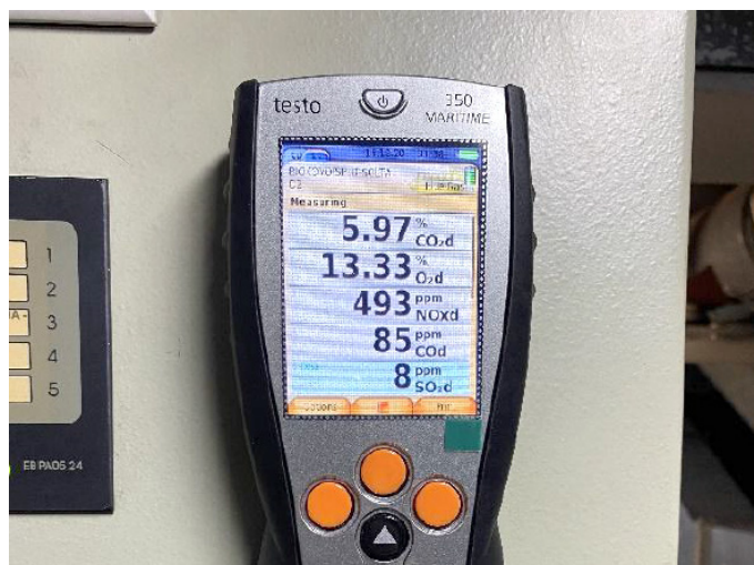
Figure 7. Exhaust gas measurement