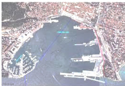
Figure 1. City port of Split 7)

The port of Split is located in the central Adriatic and is the largest port in Dalmatia with proximity to the city center (Figure 1). Port offers 27 berths for mooring of passenger and ro-ro passenger ships in national and international traffic 6) . A large percentage of the emissions from ships in the maneuvering phase and while at berth has an impact on the city residents. Due to the coast indentation, short distance between City port of Split and islands, and air emission spreading, even at sea ship phase could impact the residents. Therefore, it is of high importance to measure and quantify these emissions.