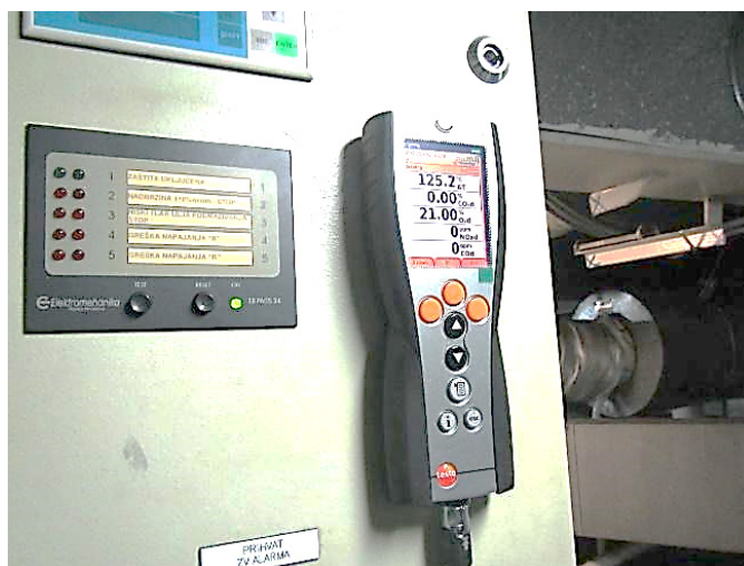
Figure 3. Control unit