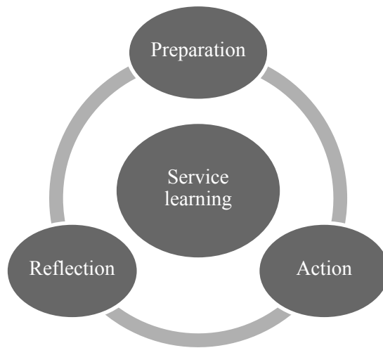
Fig. 2 Service learning phases

learning, they have to prepare community where showed clearly needs to work with. Preservice science teachers should think and act based on community needs and problem basesby service learning as shown in Fig. 2 (Prasertsang & Nuangchalem, 2013; Nuangchalem, 2014b).