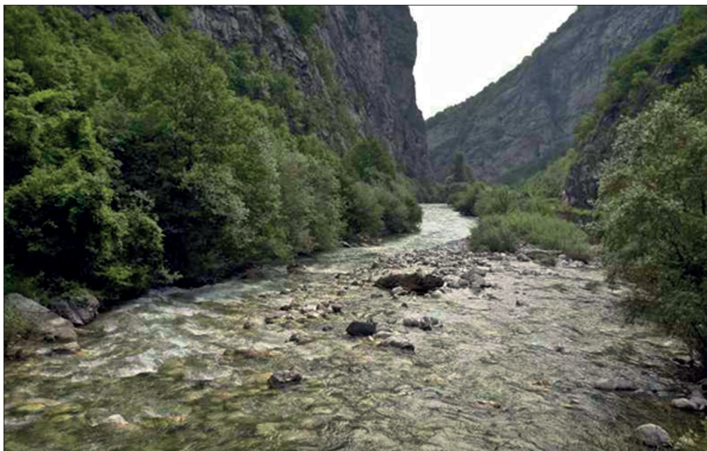
Fig. 1. Lumbardhi Peja river

cated at an altitude of 1849 m above sea level and the other side has located at 2000 m above sea level. From its origins in the city of Peja, the river flows in a river bed which is long 34 km. The river Lumbardhi Peja is supplied by groundwater flows in the mountainous area that means from Bjeluha and Jezer on the right side and Boga, Drela and Alag on the left side (Fazliu, 2012).