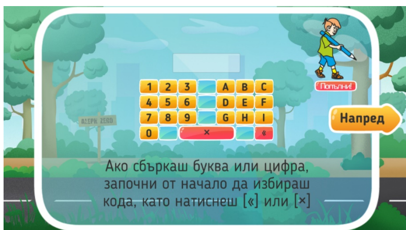
Figure 2. The DRM module access screen

Initially, the players access the game via a web browser on a desktop machine or through the android app (clients). After some initialization and information screens, they are presented with the interface of the DRM module. The latter serves as a protection module to keep unauthorized users away, since the game URL can be accessed from any location. Then, players need to enter their 6-character access keys in order to access the training scenarios (fig. 2). For access keys, we generate random alpha-numerical characters, checking if the generated key already exists in the database. Of course, a more sophisticated cryptographic and authentication approach can be used but for all intents and purposes the suggested approach performs reasonably well.