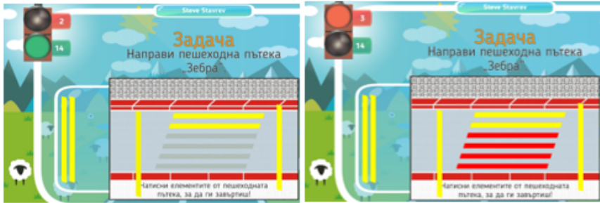
Figure 3a, 3b. Green (a) and red (b) points (upper left) are represented as a traffic light. Players get hints (colored in red) for re-attempted scenarios

The scoring system differs from the traditional accumulation of points, present in serious games (Laamarti 2014). From a pedagogical point of view, it is important to make note of the number of attempts users are allowed to solve a situation or answer a road safety related question. First-time correct answers are awarded a green point, whereas wrong answers and subsequent attempts are awarded a red point. To emphasize the importance of first-time correct answers, they are visualized as a green traffic light in the top-left corner of the UI, whereas red points are drawn as a red traffic light (Figure 3a and Figure 3b). In addition, there are correct and incorrect animations that play after each situation solving attempts.