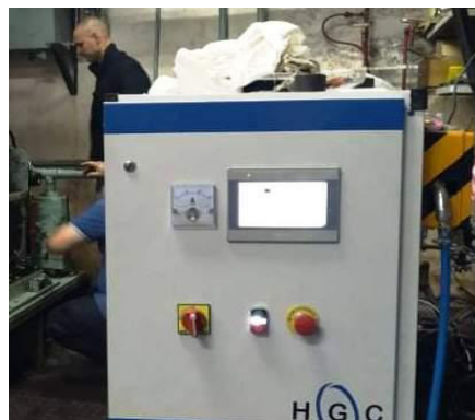
Figure 2. Gas generator

The hydrogen experiment was performed on a VST 4C gas generator, manufactured by Hydrogas. This machine is an oxy-hydrogen gas generator. It produces stoichiometric gas mixture composed of hydrogen and oxygen. The gas mixture is a useful product which in turn is used to clean international combustion engines of any type, size, power, fuel and purpose. The VST-4C is automatic and the operator must set the operating mode limits by providing a front-facing display for this purpose performing command and control functions. The gas generator is