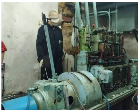
Figure 1. Marine diesel engine SKL3NVD24

A piston pump provides the incoming water to the open cooling circuit and a centrifugal pump provides cooling of the cylinder block and the cooling spaces of the cylinder head through water-water cooler. Both pumps are driven by the crankshaft via a gear drive. The engine is started with the help of compressed air at a nominal pressure of 30 bar and a minimum rotation pressure of 12 bar. The nominal speed is 600 \text{ min}^{-1} and the minimum speed is 300 \text{ min}^{-1} . The rated power of the engine is 44.1 kW or 60 hp. The working volume of the cylinders is 17.32 \text{ dm}^3 ( 5.76 \text{ dm}^3 for each cylinder). Stand KI2139B-GOSNITI is designed for testing engines with nominal torque of 25-40 kg/m and crankshaft speed of 1500-3000 \text{min}^{-1} . As the operating frequency of the engine is 300-600 \text{min}^{-1} , to work together with the electric brake, an increasing gear is required. For this purpose, a multiplier with a gear ratio of 1:5 is installed. The supply voltage of the stand is 380V, the frequency is 50 Hz. The load capacity of the stand is 210kW. The breaking and torque measuring device is a pendulum-type weighing mechanism.