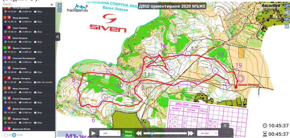
Figure 2. Visualization of the movement of major Atanas Ovcharov – winner of the race

Each participant has a GPX file which is saved in the system, through which it is possible to measure his speed, distance and elevation during the race. Figure 2 shows a graph of the elevation of the winner in the men's race – major Atanas Ovcharov. Its maximum elevation is 830.4m, minimum 734.5m and average 790m. This option allows quantitative comparison of the elevation gathered in the race (Figure 3).