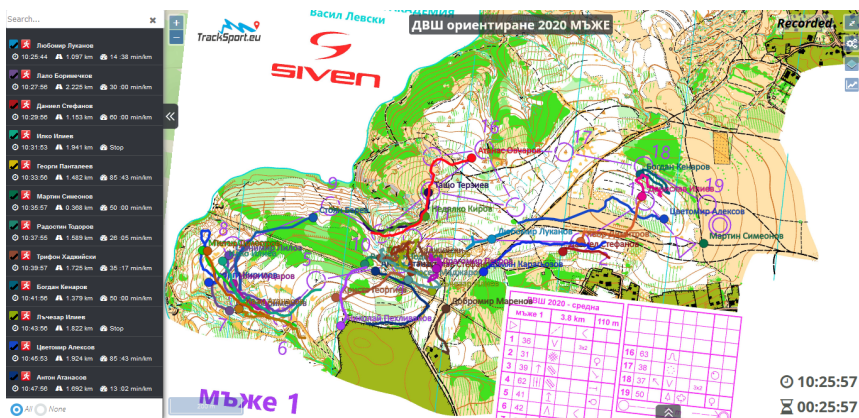
Figure 1. Visualization of the movement of male competitors

The tracking of the military orienteering events began in 2016. Twelve events were created in the Tracksport system for five years – three women races, three men races and six relays. Simultaneous tracking provides quick visual information about the movement of the group. But additionally, it is possible to present a graphical presentation of the movement between the checkpoints of one or all of the observed competitors (Figure 1).